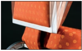
The Comfort of Postureflex

The Postureflex™ SFB 91882 gains its unique styling cues by combining traditional silhouetted backs with a center-flex spine to produce a distinctive look. Complement this with a sculpted waterfall seat, and your selection of fabric and finish, and you have a chair that communicates your unique style and décor. This banquet stacker blends the comfort of a center-flex spine and silhouetted back with the ergonomic characteristics of Bertolini's proprietary Flex-Fit™ polymer seat and a generous portion of our exclusive BLUE commercial grade foam to provide your guests with uncompromising seating comfort. Under its smooth exterior lies the industry's most durable and sustainable seating structure. We take the industry's strongest frame and add our ZERO Maintenance Flex-Fit™ seat with BosScrew™ technology for rock solid durability. All of this produces a stunning chair that lasts longer and needs replacing less often.