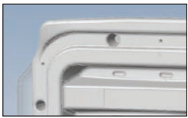
Innovative Flex-Fit™ Seat