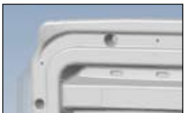
Innovative Flex-Fit™ Seat