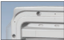
Innovative Flex-Fit™ Seat